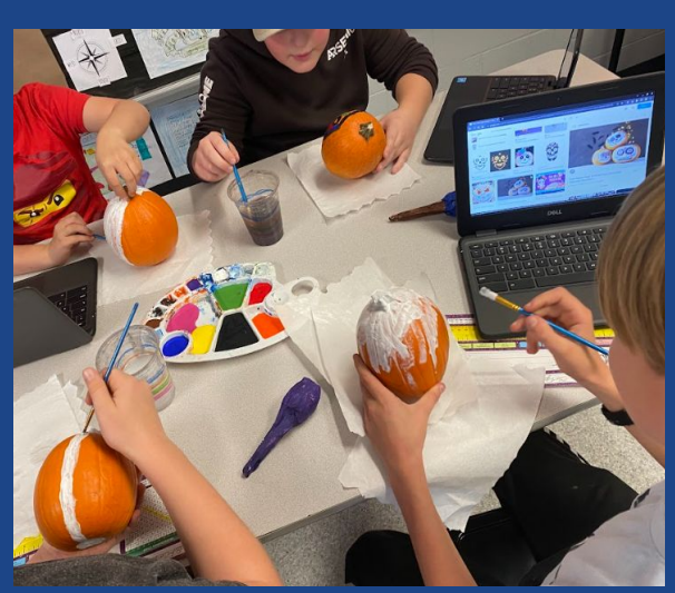
The 'Next Stop, Mexico' Option class has been busy creating all sorts of Mexican inspired crafts.